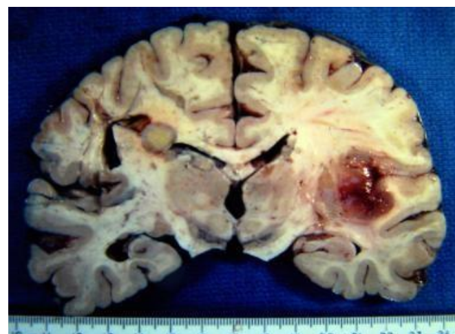
Figure 2: Tuberculoma is the round grey mass in the left corpus callosum. The red meninges on the right are consistent with irritation and probable meningeal reaction to tuberculosis.

Hydrocephalus and tuberculoma are Complications of Tuberculous Meningitis [16]. Multiple small cerebral and spinal tuberculomas are seen when tuberculous meningitis is a sign showing the existence of military tuberculosis [17]. The bacilli can also cross the Blood Brain Barrier and enter the Cerebro Spinal Fluid (CSF), which helps in the regulation of intracranial pressure and acts as hydraulic shock absorber [8,18], causing Blood borne spread of Tuberculous Meningitis.